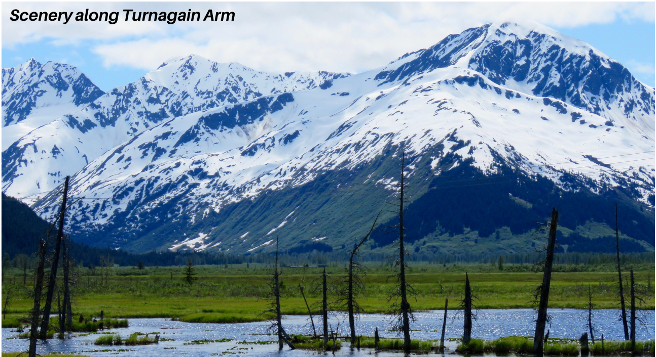
Scenery along Turnagain Arm

Today will be spent on the water cruising the dramatic and dazzling coastlines of Resurrection Bay and the open water around the Chiswell Islands. The splendid scenery on this cruise is enough to justify the trip, but the birds and mammals we will see just might relegate the vistas to the realm of afterthought.